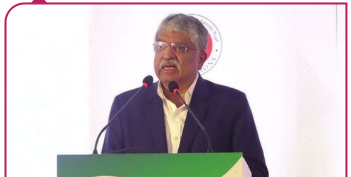
Padma Bhushan Nandan Nilekani* Infosys & India's Digital Transformation Leader

The global clean energy market reached over $1.2 trillion in investments in 2024, while electric vehicle sales topped 17 million units worldwide. Digital mobility services are estimated to move more than 30% of urban commuters in leading cities by 2030. New skilling programs aim to train over 80 million workers globally in renewable energy and connected mobility fields by 2030. With industries converging and automation on the rise, the focus is on building talent, upgrading infrastructure, and enabling access for all. The era of sustainable growth, empowered by technology and human capital, is moving from ambition to action!